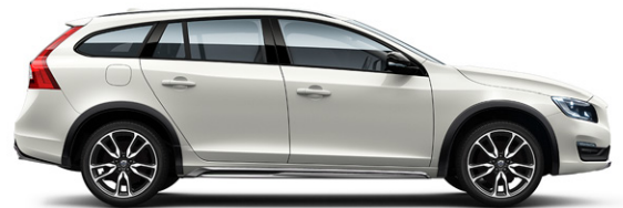
707 Premium Crystal White Pearl (Sparkling metallic, shifts from white to shimmering warm yellow-white effect depending on light and viewing angle)