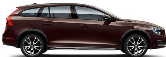
712 Rich Java metallic