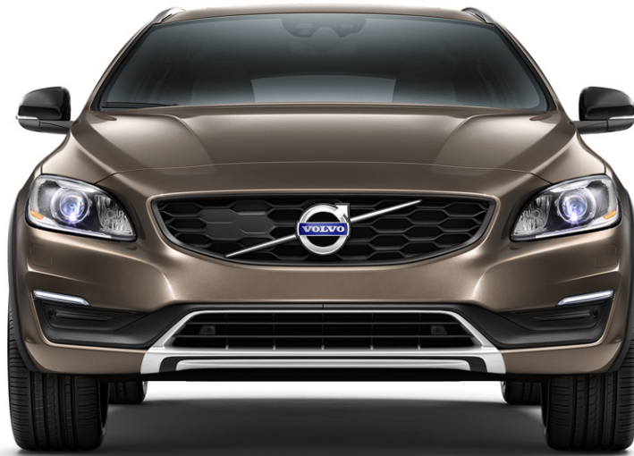
700 Twilight Bronze metallic