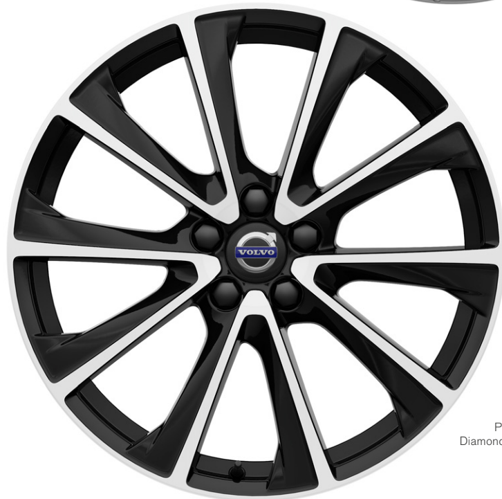
Portia, 8x19" Diamond Cut/Glossy Black