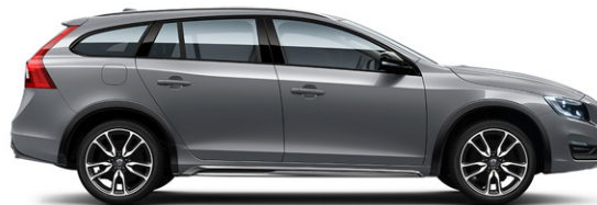
714 Osmium Grey metallic