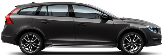
492 Savile Grey metallic