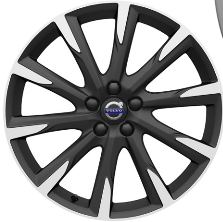
Bor, 8x19" Diamond Cut/Matte Black