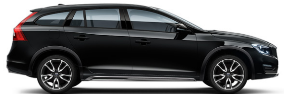
717 Onyx Black metallic