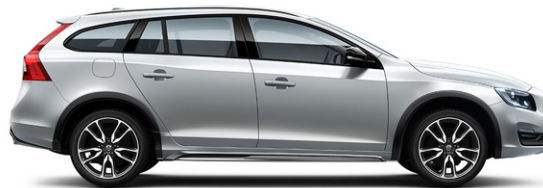
477 Premium Electric Silver metallic (Sparkling metallic, shifts from silver to blue effect depending on light and viewing angle)