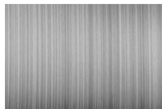
Shimmer Graphite aluminium