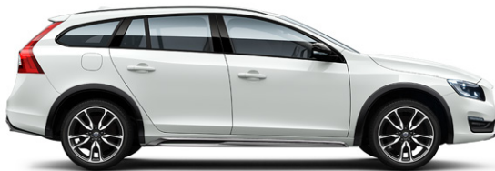
614 Ice White

Material. “When you look at our palette, you’ll find that it contains softer tones that are more connected with nature, with a few bold splashes.” Being Swedish, our designers are inspired by the ocean and the sky, but also by the shore and the way the light changes throughout the seasons. Every tone speaks of uniqueness, quality and charisma.